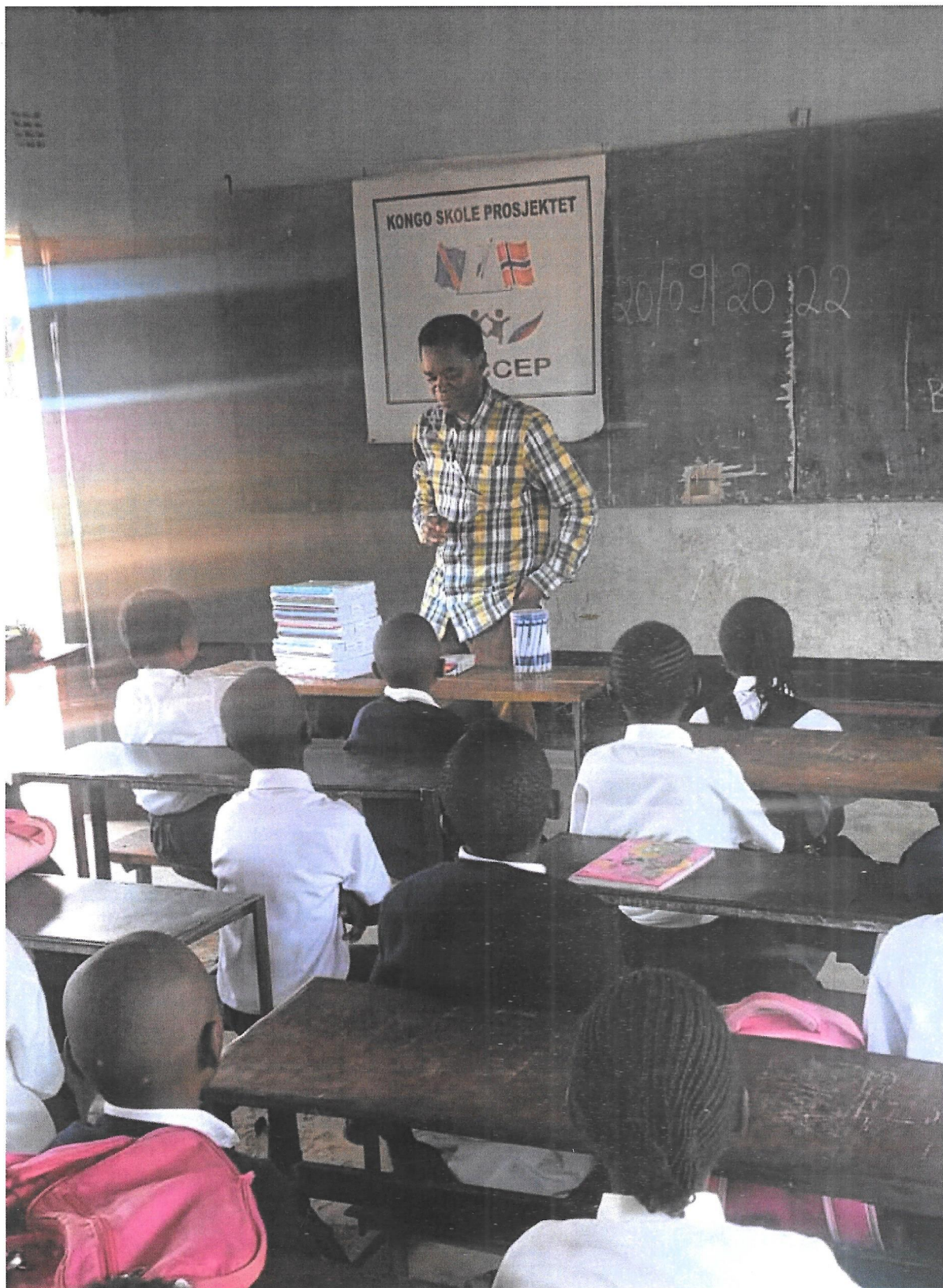
Visit to Mtoto Complexe School on 20/09/2022 with Children in 3 rd class and distribution of books and pens.