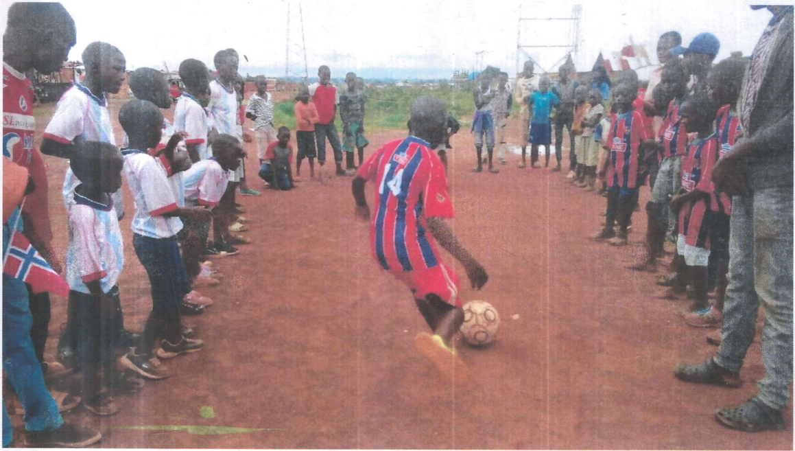
Koccep provide Sport activities to different schools. Sport is important for the children.