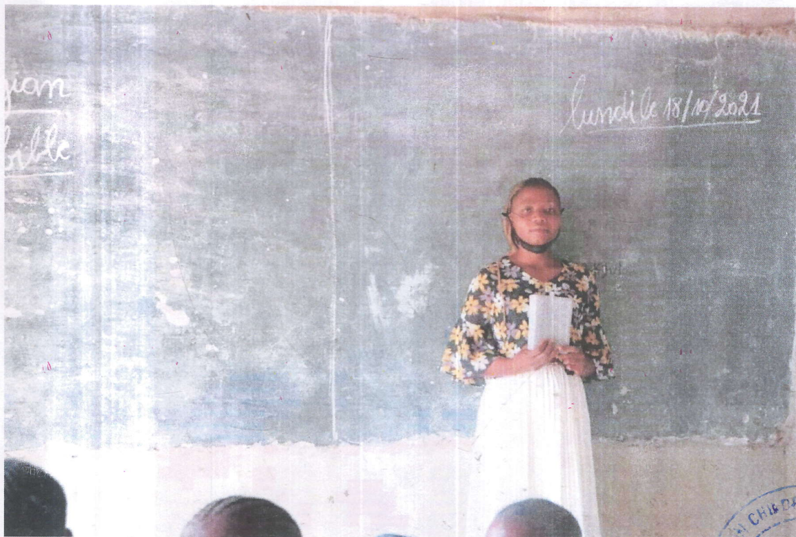
Teacher in Class.